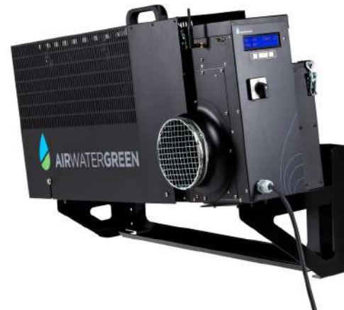
A FLEX fixed to the wall with a wall mount